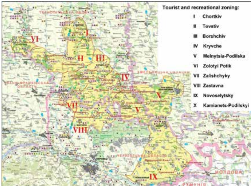
Fig. 1. Tourist and recreational zoning of the Podillia speleoregion