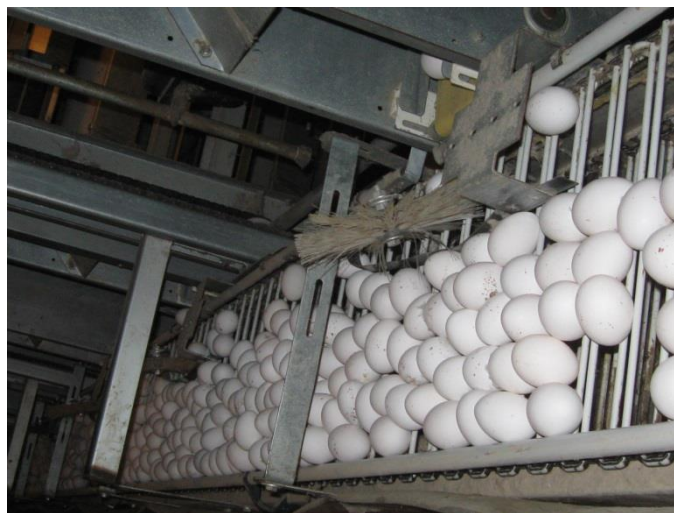
Figure 1. Chicken eggs contaminated with red mite

As a result of monitoring studies of poultry farms from the breeding of laying hens, when they were kept in cell batteries, 76.5 % of the premises were invaded and populated with chicken mites. In industrial poultry farming, the intensity of invasion depended on the duration of maintenance of laying hens in poultry houses. Extensity of invasion was minimal – 23.5 % in 2 months after planting birds in poultry houses and reached 100% before the end of the production cycle. When introducing chicken mites from outside from the outside into a prosperous farm, a high degree of colonization of the Dermanyssus gallinae was recorded in 80-100 days, with chickens in poultry houses. Eggs from dysfunctional poultry houses had characteristic contamination of the shell (Figure 1).