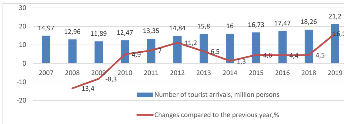
FIGURE 2 Dynamics of the number of tourist arrivals in Poland in 2007–2019