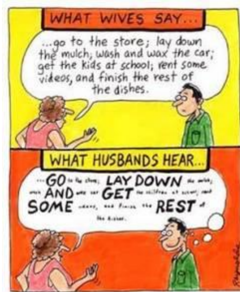
Fig. 2. Critical function

The non-verbal component is expressed by colour – red emphasizes the words and expressions that are important for the perception of the man. The comic effect of the verbal component lies in the game with fonts – important information for the man is depicted in capital letters in bold, and unimportant – with a very small font that cannot be read. Laziness and indifference to household chores, often attributed to men, are exaggerated due to the bold type. The man rejected everything superfluous, except for the verbs important to him ( GO... LAY DOWN... AND... GET... SOME... REST ). Also comical is the expression on the husband's face, namely his reaction to his wife's instructions – rejecting «extra» information in his understanding, the husband rejoiced and focused on what was important.