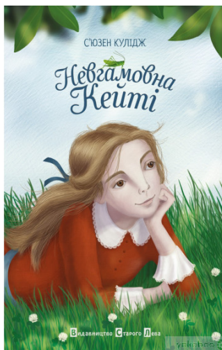
Illustration 4. Susan Coolidge «What Katy did» 4