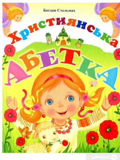
Illustration 2. Bohdan Stelmakh «Christian alphabet» 2