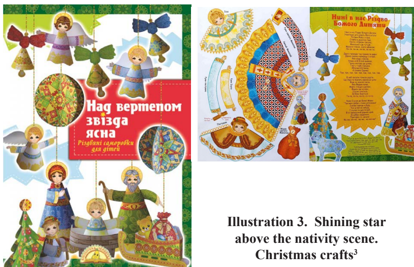
Illustration 3. Shining star above the nativity scene. Christmas crafts 3