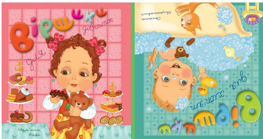
Illustration 1. Myronovych Oksana «Poems for girls and boys» 1