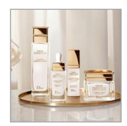
Figure 2 – Design of packages of luxury cosmetics