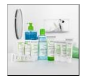
Figure 4 – Design of medical cosmetics packages