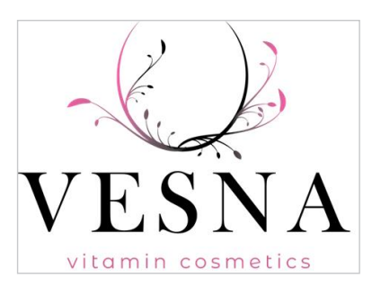
Figure 13 – The developed design of the "VESNA" brand logo