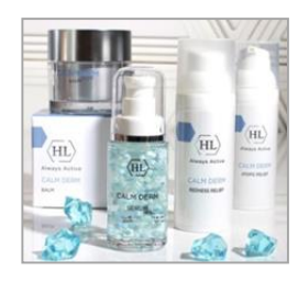
Figure 3 – Design of packages of professional cosmetics

Cosmeceuticals or medicinal cosmetics use the following visual aids in packaging design: color solutions and fonts. Sometimes graphic elements are used in the design of such packages, but mostly they are absent. Medicinal cosmetics packages usually emphasize indications and main properties, because their naturalness is obvious and does not require additional selection in this category of cosmetics (Figure 4) [16; 17].