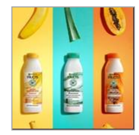
Figure 1 – An example of the design of mass-market cosmetics packaging with an emphasis on naturalness and being organic

Manufacturers of luxury or professional cosmetics often emphasize the category in their design, despite the fact that the composition of these cosmetics usually has a very high percentage of natural components. Their packaging has the maximum visual similarity in all products, which emphasizes the high status and image of the brand (Figure 2) [12].