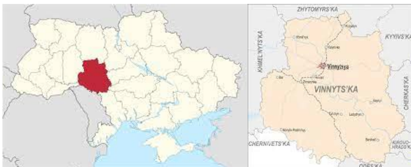
Figure 3. Location of Vinnytsia on the map of Ukraine

preliminary work of its representatives with the necessary statistical information. However, even a cursory assessment by a specialist of seven groups of indicators allows to see the vulnerable elements of the urban ecosystem and can be the basis for priority adaptation measures.