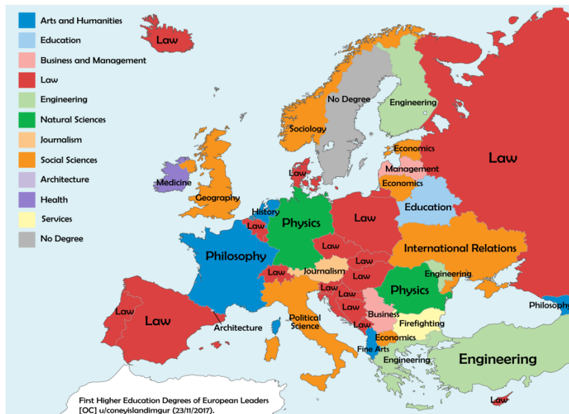
Figure 3. Map of the popularity of the first degrees of higher education in Europe [3]

The top 10 specialties with the highest passing scores in 2019 are listed in Table 2.