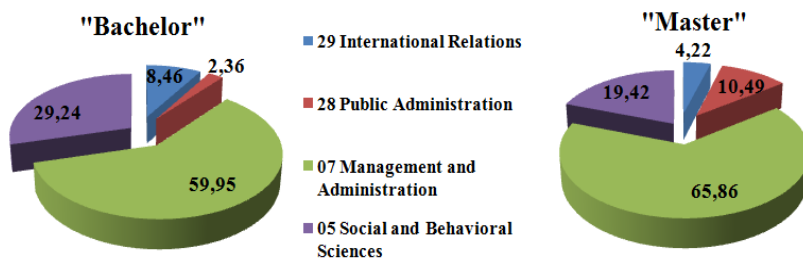
Figure 2. Structure of the number of students in the Higher Education Level III-IV accreditation levels in the economic branches of higher education «Bachelor» and «Master» degrees in the 2017/18 academic year, %

In the structure of the number of students in the Higher Education Levels III-IV levels of accreditation in the economic branches of knowledge of higher education degrees «Bachelor» and «Master» the greatest share is the branch of knowledge 07 «Management and Administration» – 59.95% and 65.86% respectively (Figure 2).